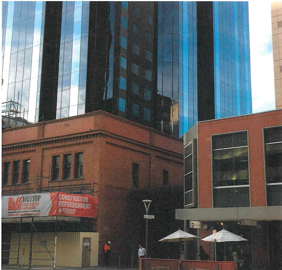
Grenfell Street offices with tower set back behind historic face/podium and adjacent development with comparable human scale podium, such that both sites have equal development potential.