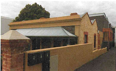
209 Melbourne Street, North Adelaide