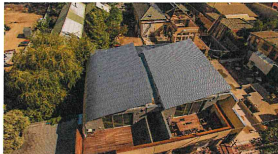
My own development in Brown Street, Norwood