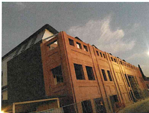
Sheppards Lane, Norwood