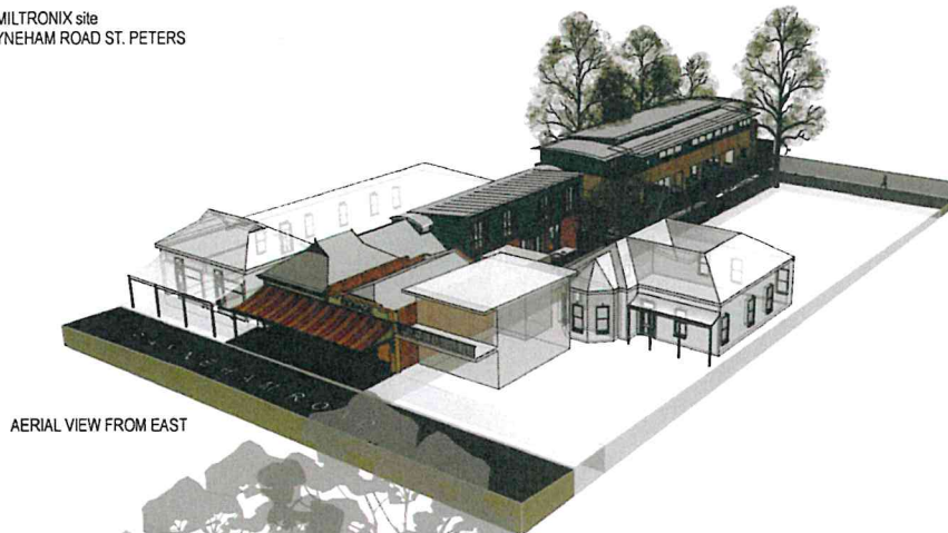
AERIAL VIEW FROM EAST

former MILTRONIX site 125 PAYNEHAM ROAD ST. PETERS