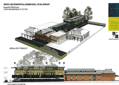
125 Payneham Road, St Peters